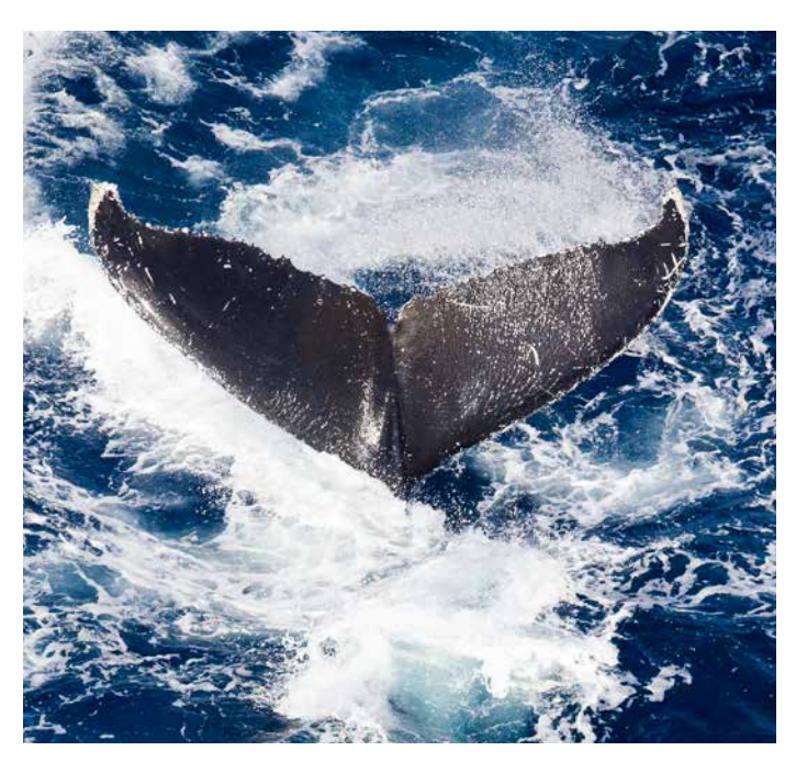
Humpback whale, Indian Ocean

Seamounts are undersea mountains rising over a kilometre from the seabed, and have been described as oases because of their highly diverse wildlife. They channel nutrients to surface waters where they support