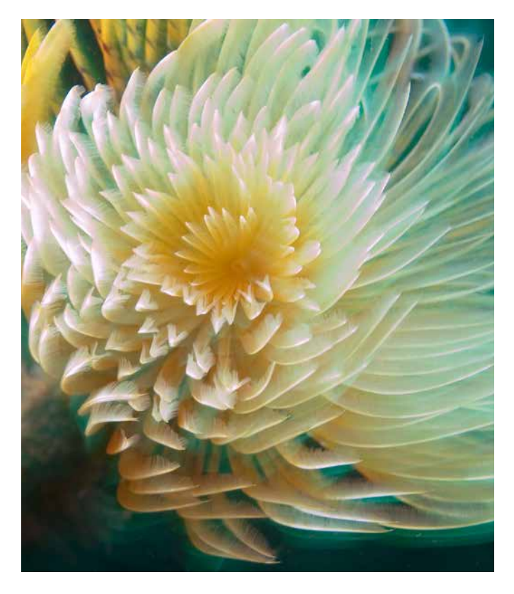
Spiral tube worm, Azores

The agency responsible for regulating deep sea mining, the International Seabed Authority (ISA), is currently focused on paving the way for commercial deep sea mining,<sup>5</sup> and appears to be putting profit over protection – including by selling access to unique wonders of the deep sea to governments and corporations for mining exploration. The ISA is unable to protect the deep ocean from multiple other pressures, such as bottom fishing. The environmental impacts of deep sea mining are not necessarily restricted to the seabed: marine life in shallower waters could also be put at risk by knock-on ecological disturbances.